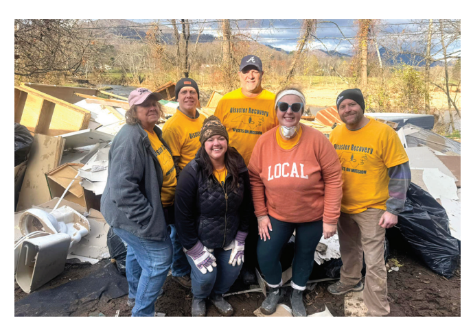
Leaders from the HRMC Give Back Team partnered with NC Baptists on Mission to assist with gutting a flood-ruined trailer just miles from the hospital after Hurricane Helene.